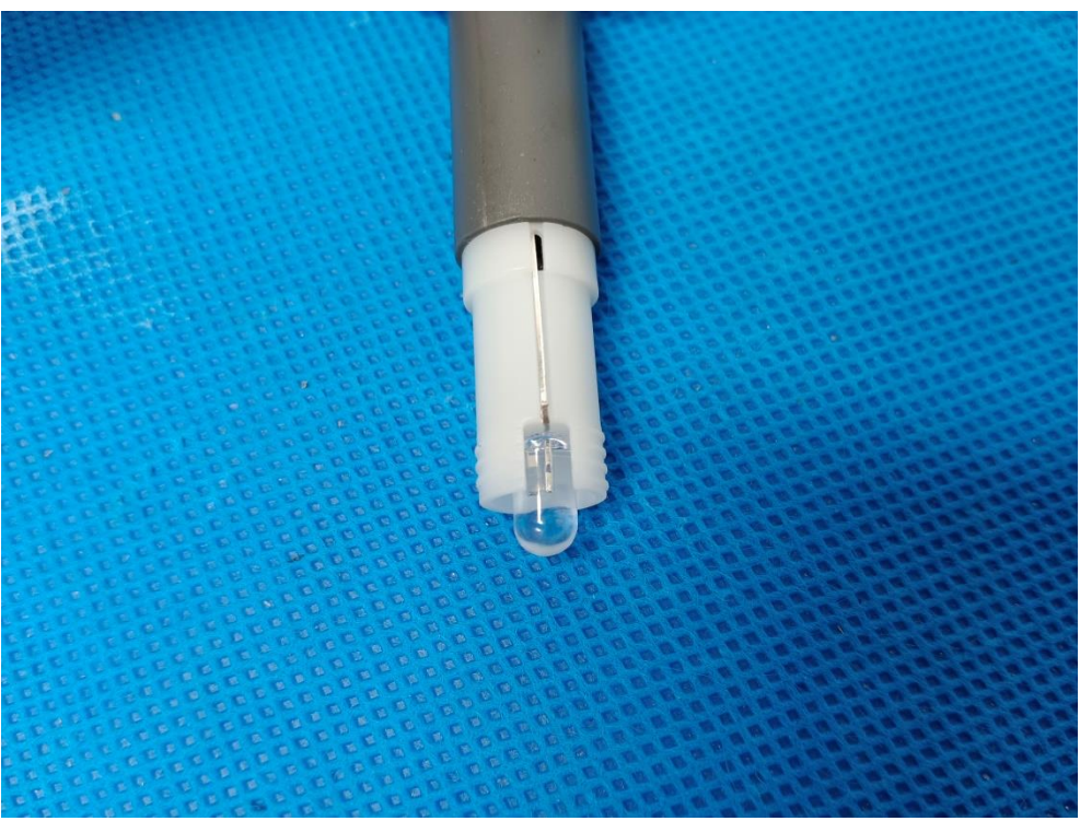
Fig.5- LED view of product