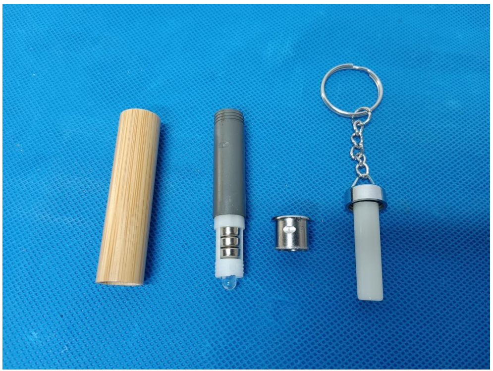
Fig.4- Uncover view of product