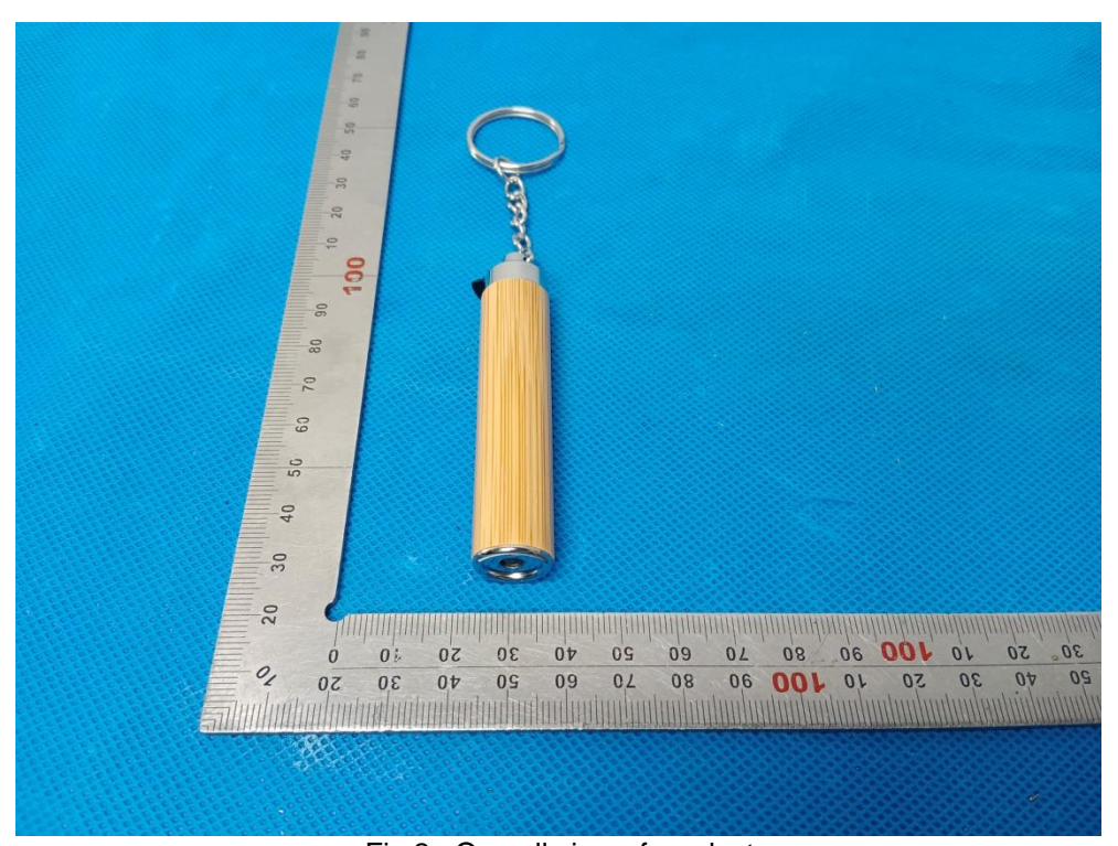
Fig.2- Overall view of product