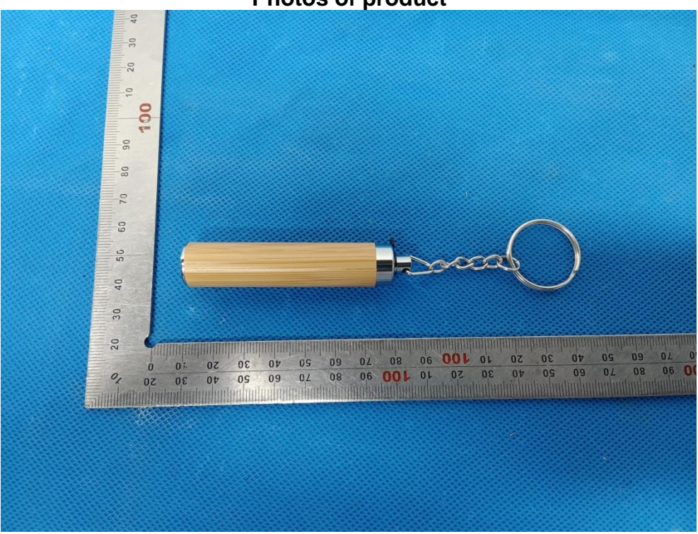
Fig.1- Overall view of product