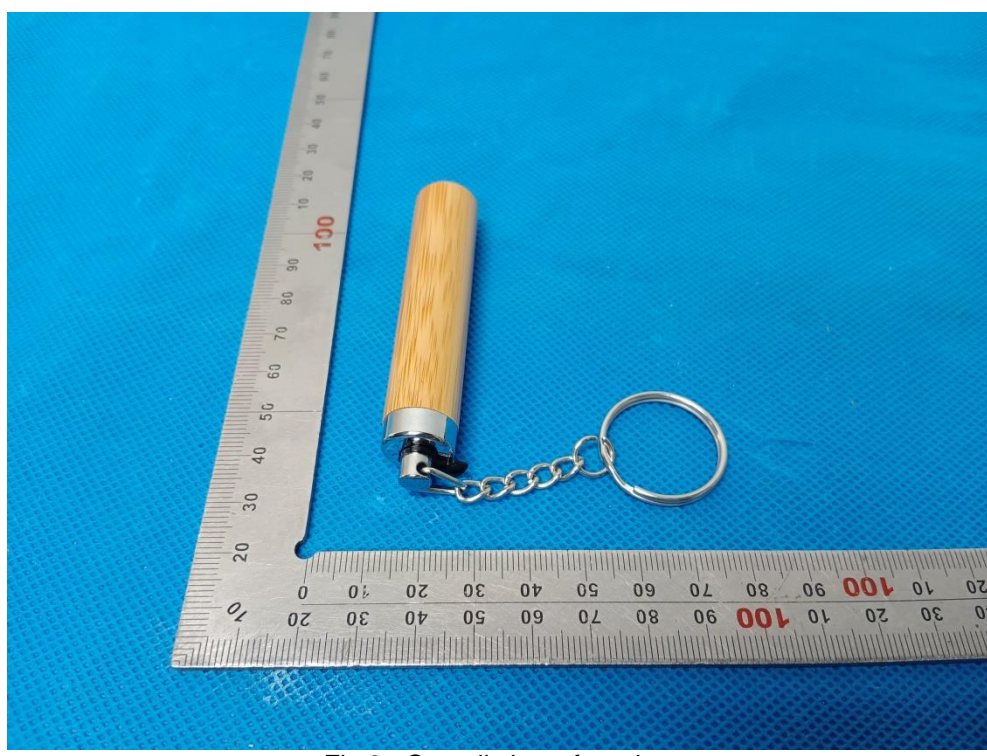
Fig.3- Overall view of product